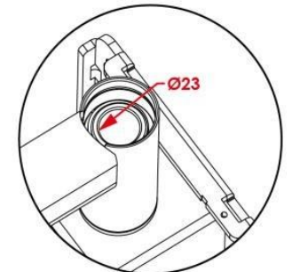
Spigot Inner Diameter